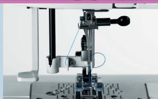
Needle-threader: because fashionistas love technology too.