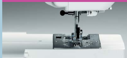
Softly, softly: foot pressure adjustable in 3 positions.